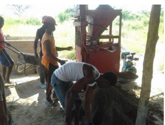
Installation of bricks making machine(left) and the young men operating the machine (right)