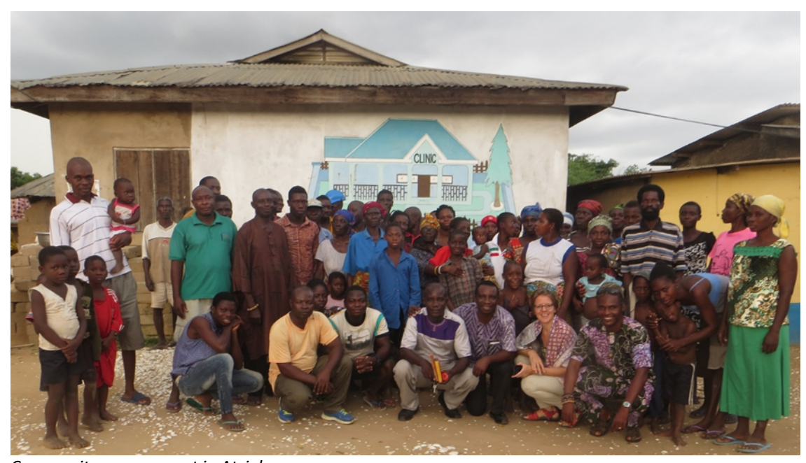
Community engagement in Atsiekpoe

As the main project site currently, SSFA engages with the Atsiekpoe community on a continues basis to monitor, evaluate, resolve project related conflicts and re-strategize on how to accomplish our goals. We spearheaded the reconstitution of the project committee as most of the previous committee had either travelled or relocated elsewhere.