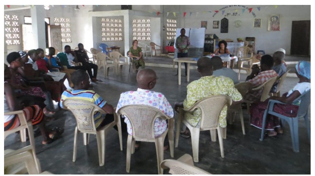
Representatives of identified groups (chiefs, men, women and youth) in a needs prioritization meeting with personnel of SSFA