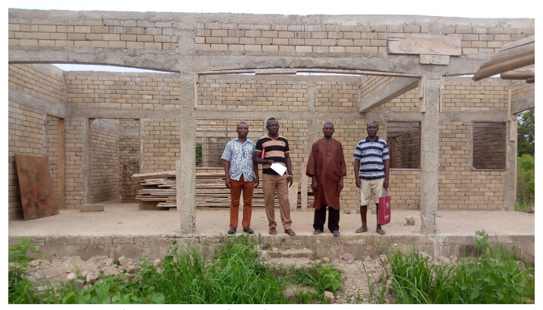
The District Engineer (holding the sheet of paper) on inspection.