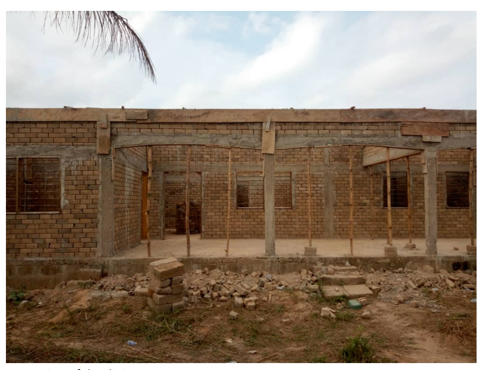
Front view of the clinic