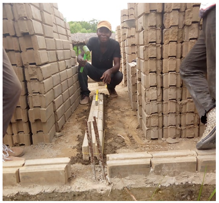
The mason laying the first course of bricks